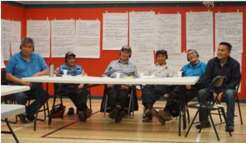
Four Elders and between 15 and 30 people participated in the workshop at different times.