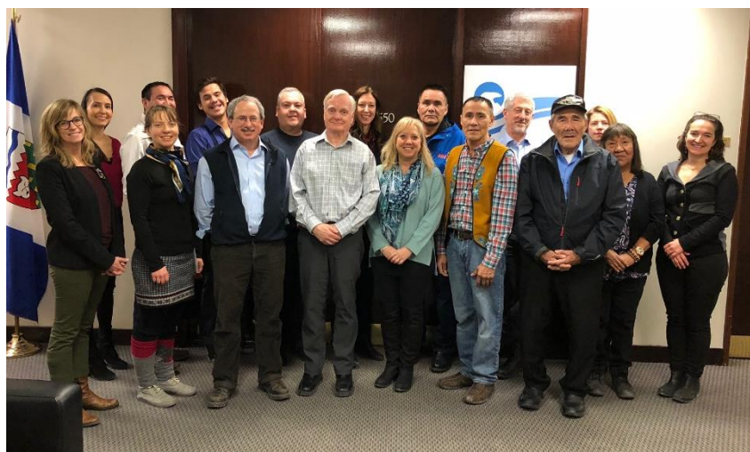
The negotiation teams for Delà Got'jne, Canada and the GNWT at the last Main Table negotiation in Ottawa.